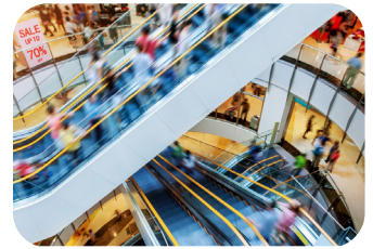
Retail (Malls & Stores)