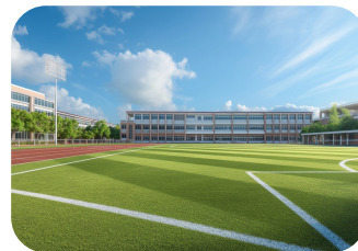
Schools & Universities