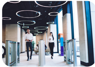
Real Estate & Smart Buildings

Every industry faces unique environmental challenges—from maintaining clean indoor air in public spaces to reducing energy consumption in round-the-clock facilities.