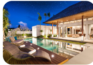
Hospitality & Resorts