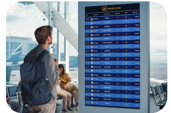
Airports & Transport Hubs