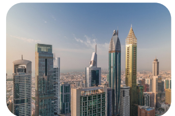
Government Facilities & Infrastructure