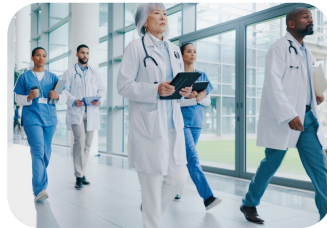
Healthcare & Clinics