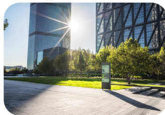
Parks & Public Spaces