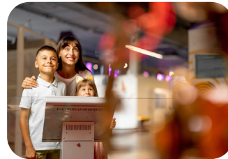
Museums & Cultural Sites